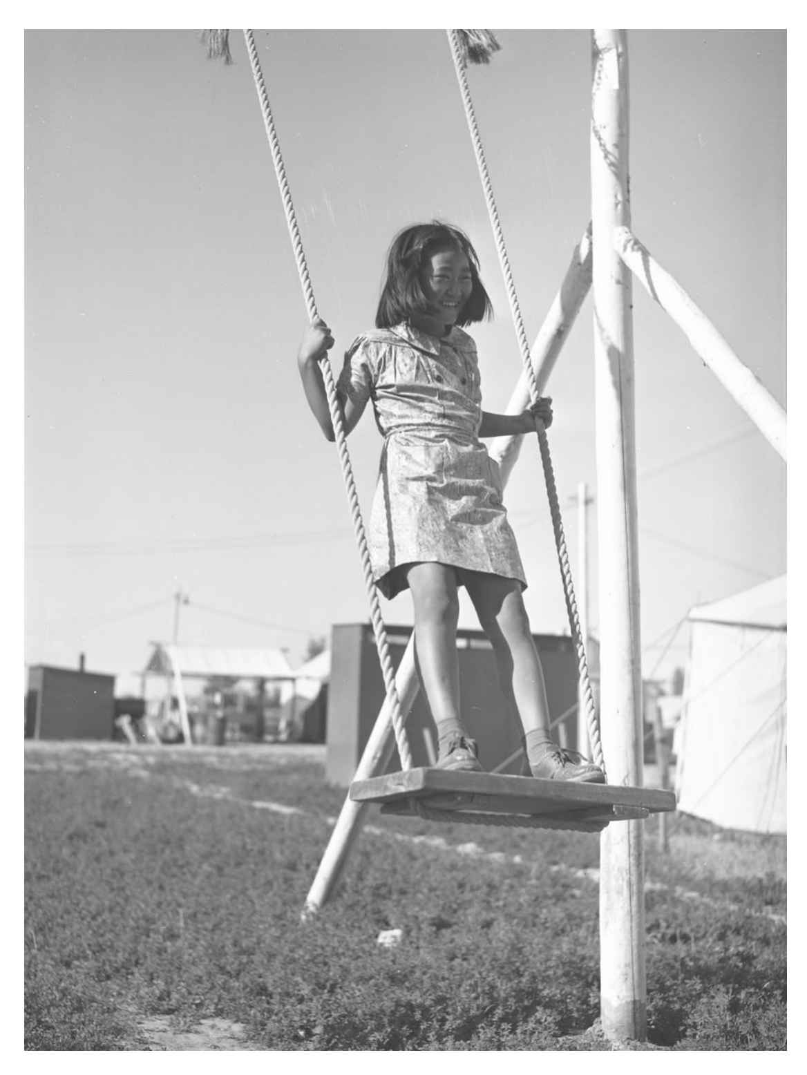
OCHC Lee #043 Child swinging at the camp near Shelley, Idaho.

Shelley, Idaho. Farm Security Administration mobile camp. Japanese child who lives with his parents at the camp.