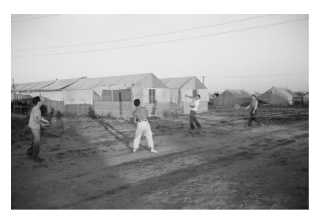
A badminton game at the Garrison's Corner camp near Nyssa, Oregon.

Nyssa, Oregon. Farm Security Administration mobile camp. Japanese Americans play badminton at the camp.