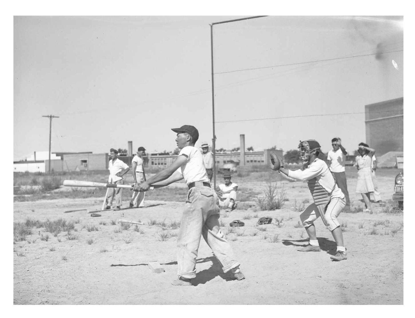
Baseball game at Nyssa High School with laborers from the Garrison's Corner camp.

Nyssa, Oregon. Japanese Americans playing baseball. They do farm work, live at the Farm Security Administration mobile camp, and use the town ballfield on Sundays when they come in a supervised group.