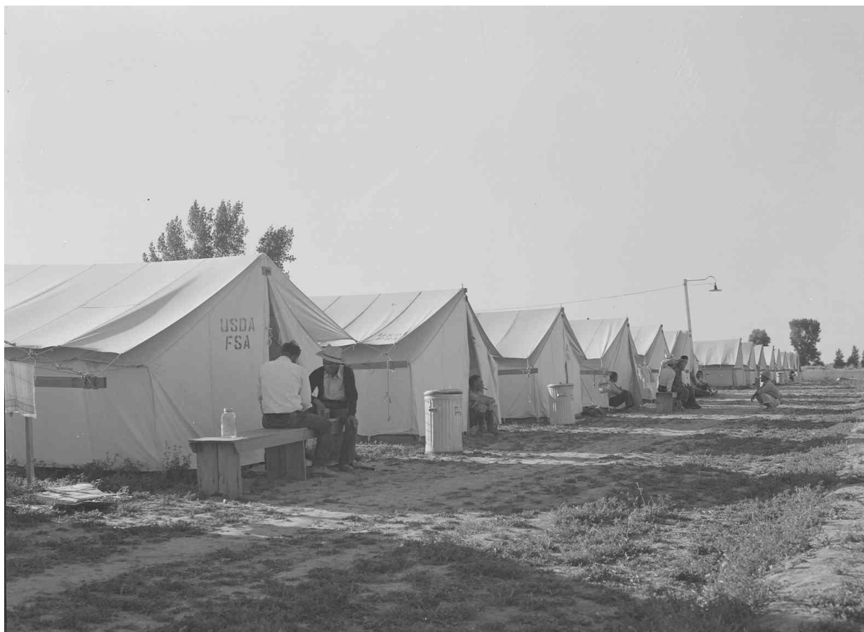
Farm labor camp near Shelley, Bingham County, Idaho.

Shelley, Idaho. Farm Security Administration mobile camp. Japanese farm workers are now living at the camp.