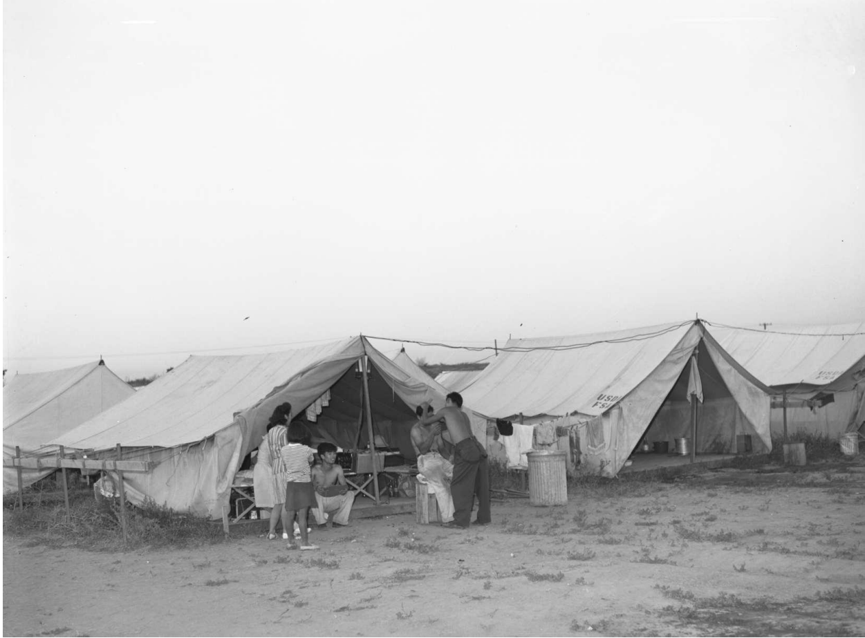
Tents at the Garrison's Corner camp near Nyssa, Oregon.

Nyssa, Oregon. Farm Security Administration mobile camp. Ordinarily electricity is not supplied to the tents of migrant families living in the FSA camps. These Japanese-Americans, who were accustomed to better living conditions, wanted the electricity and the sugar beet companies and the town of Nyssa arranged for the wiring. Some of the wiring is the Christmas tree light wiring from Nyssa. Library of Congress, Prints & Photographs Division, FSA-OWI Collection, LC-USF34-073349-D.