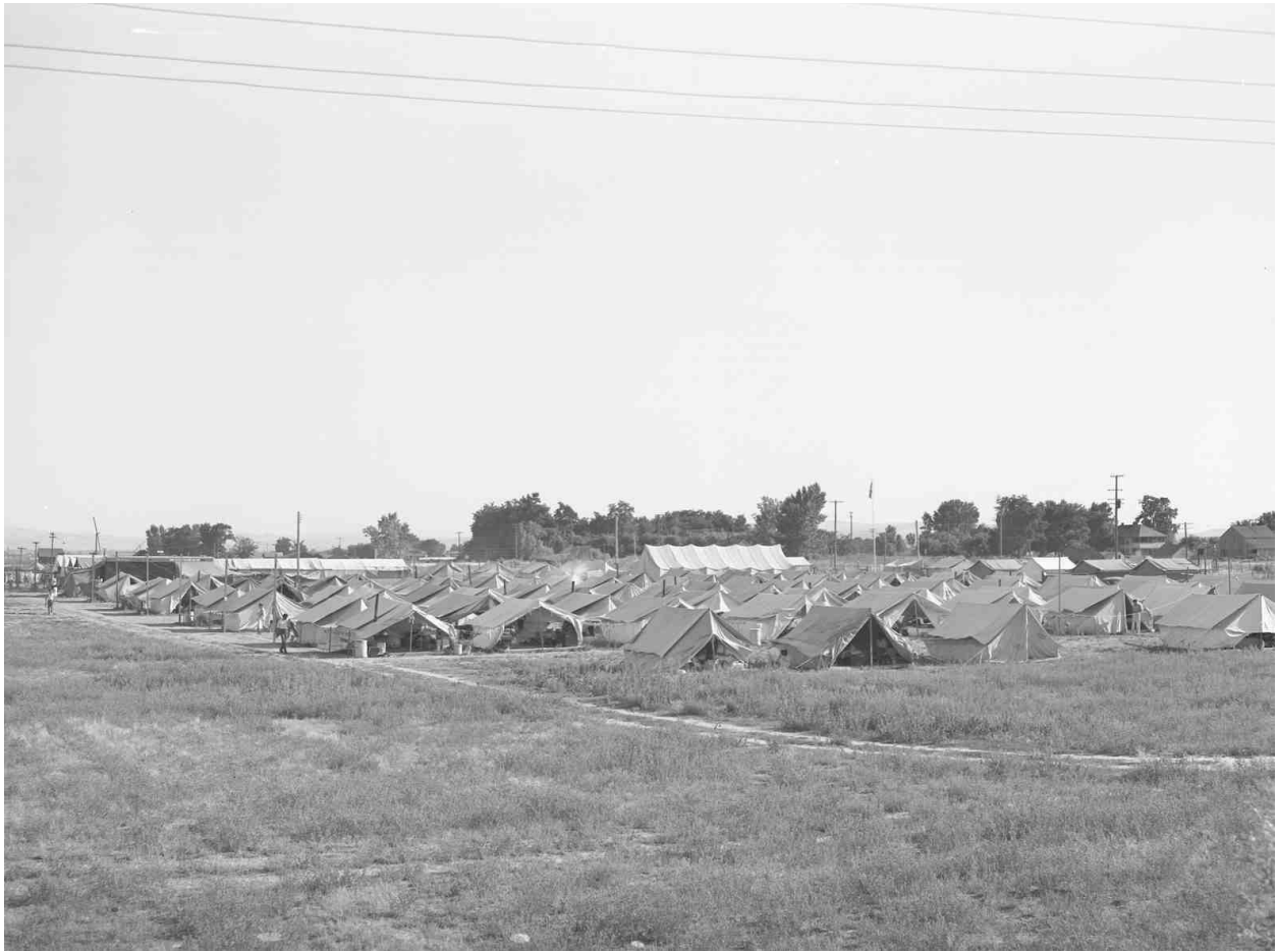
OCHC Lee #001 Farm labor camp, Garrison's Corner near Nyssa, Malheur County, Oregon.

Nyssa, Oregon. Farm Security Administration mobile camp now inhabited by Japanese Americans who volunteered to do farm work. The U.S. Employment Service and the local sugar beet companies made agreements as to wages, working conditions, transportation, recreational facilities and medical care.