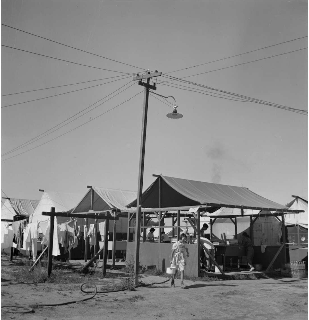
OCHC Lee #007 Laundry room at the Garrison's Corner camp near Nyssa, Oregon.

Nyssa, Oregon. Farm Security Administration mobile camp. Laundry room. Library of Congress, Prints & Photographs Division, FSA-OWI Collection, LC-USF34-073694-E.